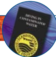
The Viking Diving in Contaminated Water Database Manual.

Viking has independent laboratory testing performed on their drysuits. This data is collected in the Viking Diving in Contaminated Water database to help customers make informed decisions and to minimize risks at all levels when diving in contaminated water. This database is available upon request.